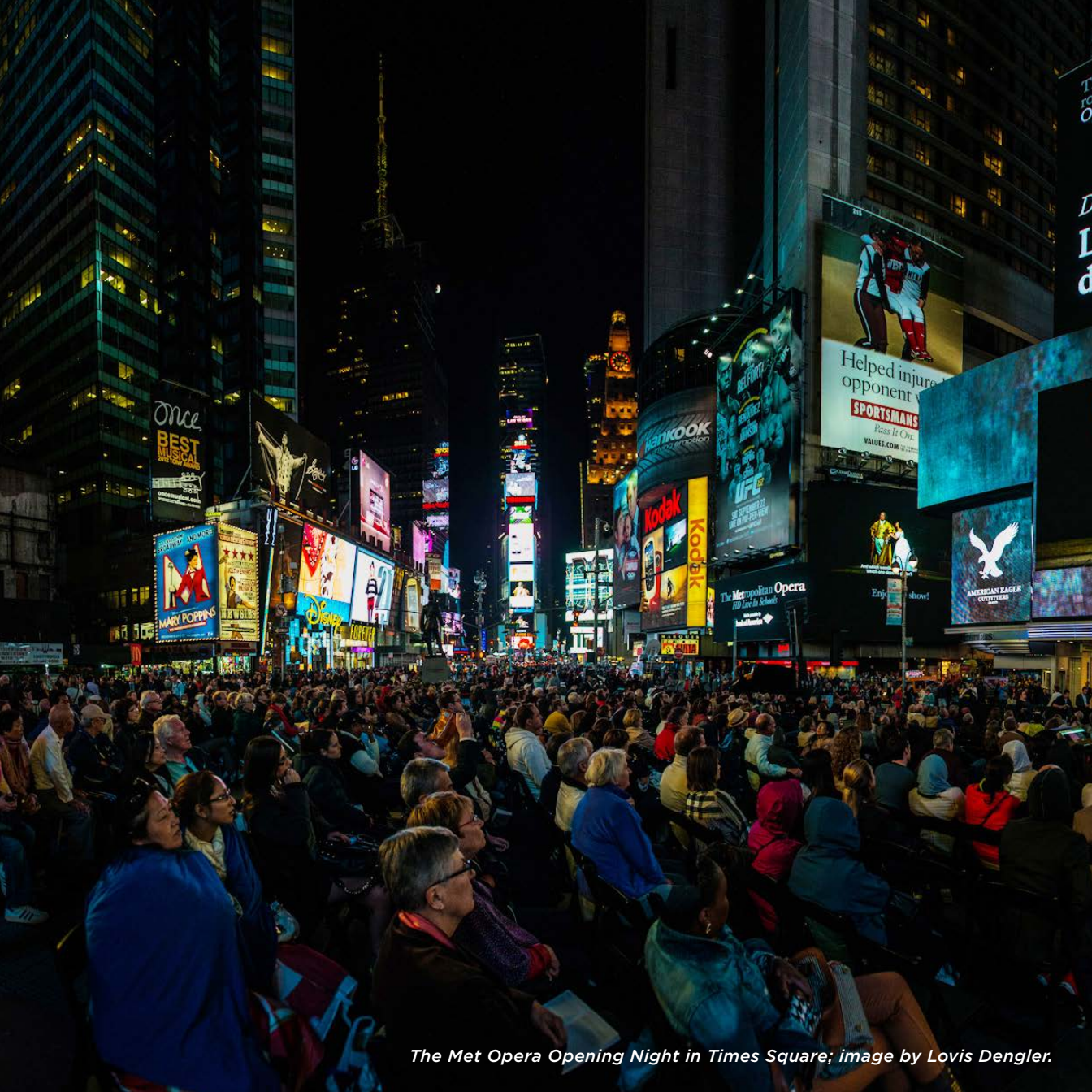
The Met Opera Opening Night in Times Square; image by Lovis Dengler.

“[The city] can stake out a cultural vision for the plazas, and by extension for public spaces all across town... by tapping into New York’s cultural and creative infrastructure, using the reboot of Times Square as a template.”