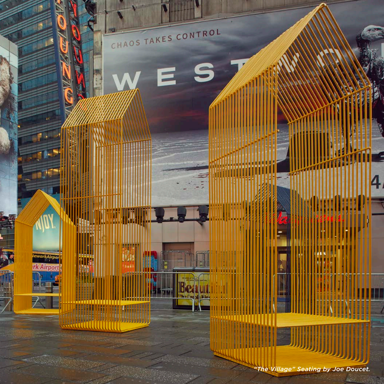
"The Village" Seating by Joe Doucet.