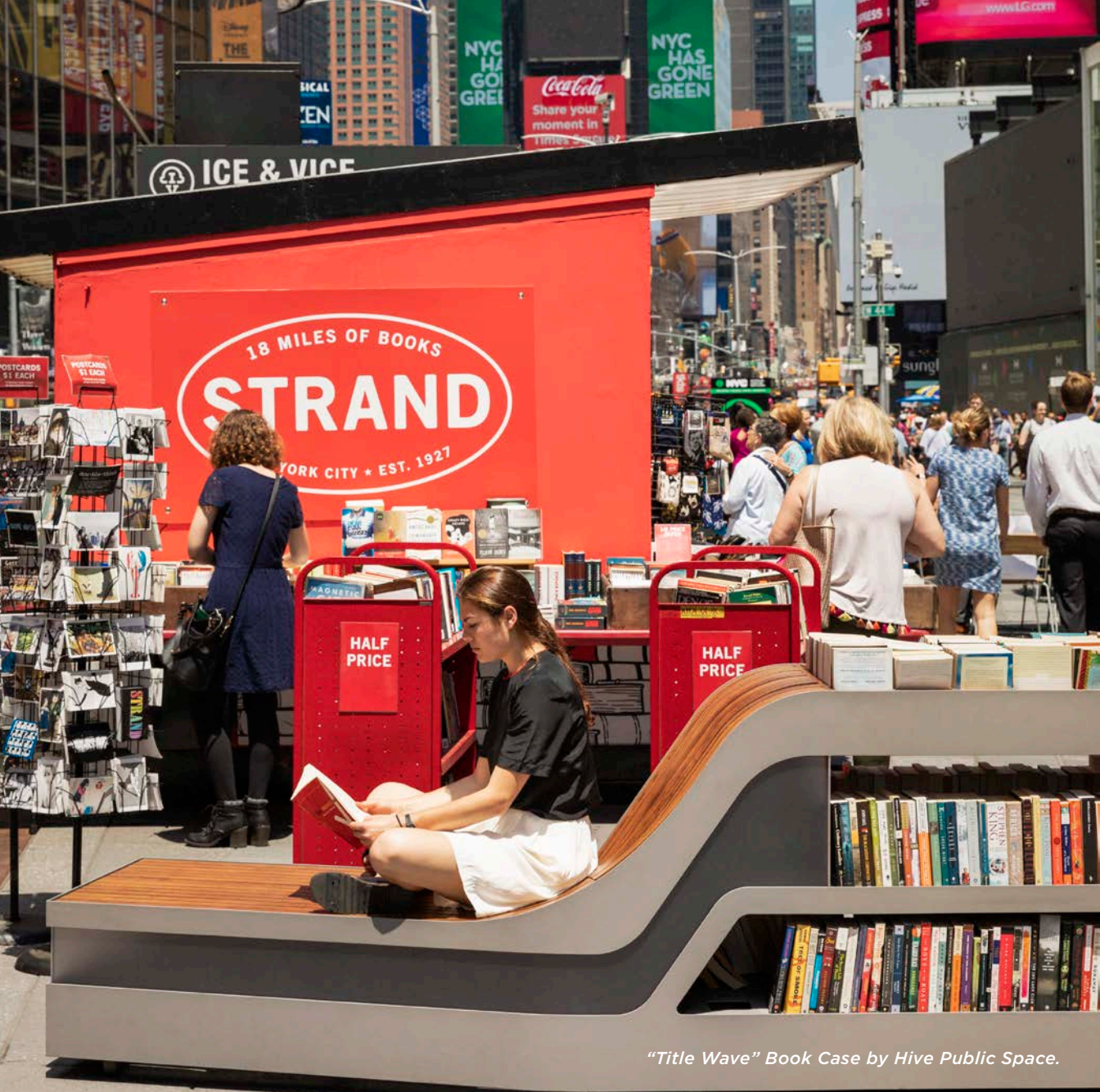
"Title Wave" Book Case by Hive Public Space.