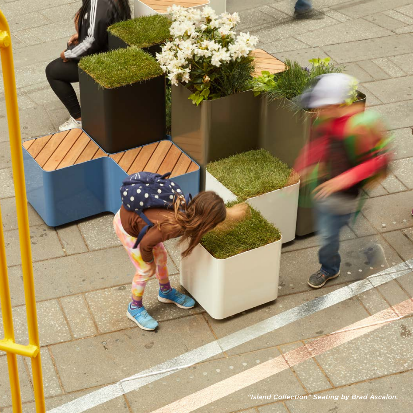
"Island Collection" Seating by Brad Ascalon.