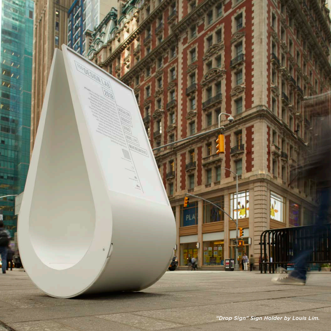
"Drop Sign" Sign Holder by Louis Lim.